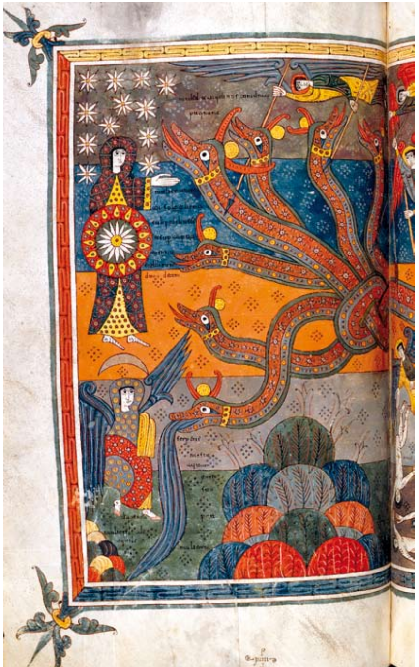
Silos Apocalypse shows the seven-headed dragon attacked with spears by St Michael and his angels, late 11th or early 12th Century. Produced at Silos when part of Spain was under Moorish rule. A wonderfully dramatic example of Christian book illustration from Spain. Courtesy of the exhibit 'Sacred', at the British Library until 23 September.