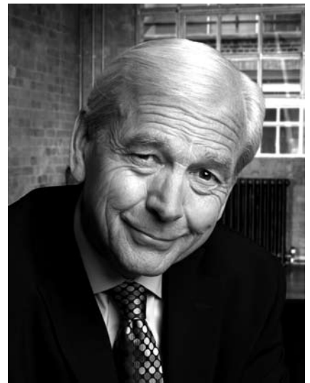
Radio 4 Journalist John Humphrys

tific discoveries can be compatible with outmoded religious dogmas and ancient texts, I would echo the words of the American Unitarian Universalist thinker and campaigner for social justice John Haynes Holmes. He said, "But when I say 'God', it is poetry and not theology. Nothing that any theologian ever wrote about God has helped me much, but everything that the poets have written about flowers, and birds, and skies,