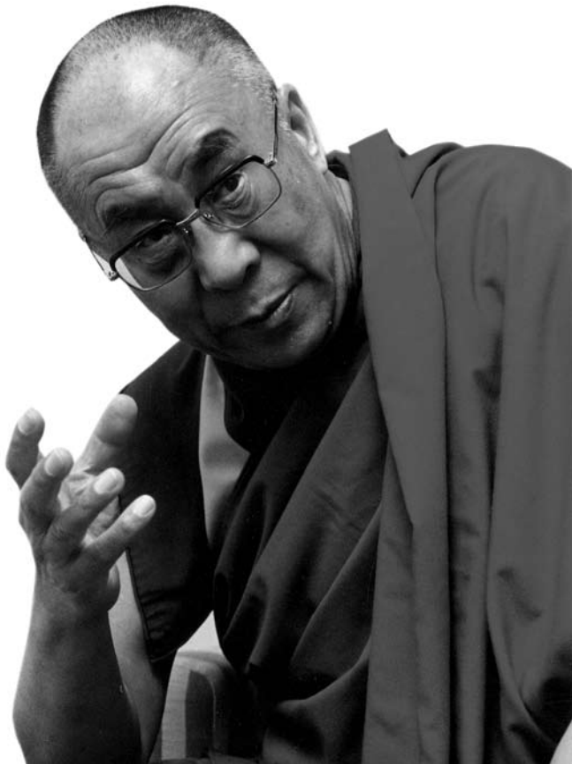
The Dalai Lama